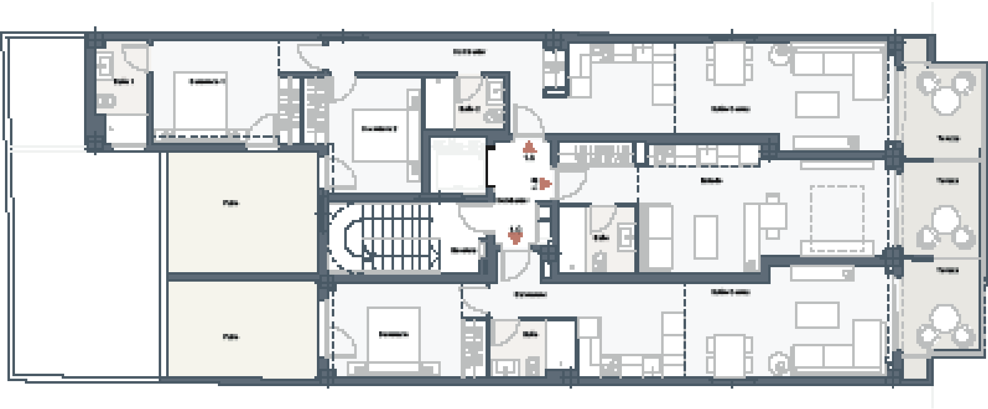
TYPE FLOOR (PRIMERA)